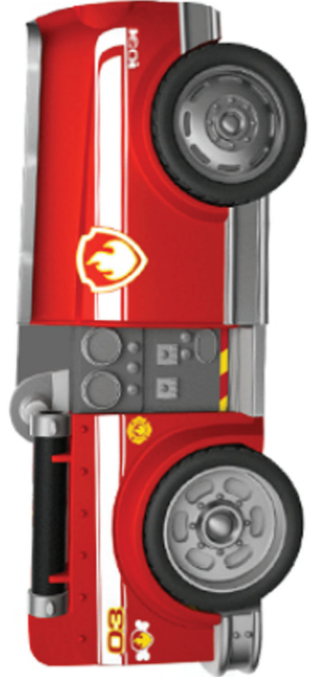
BACK OF CAR