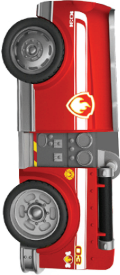
BACK OF CAR